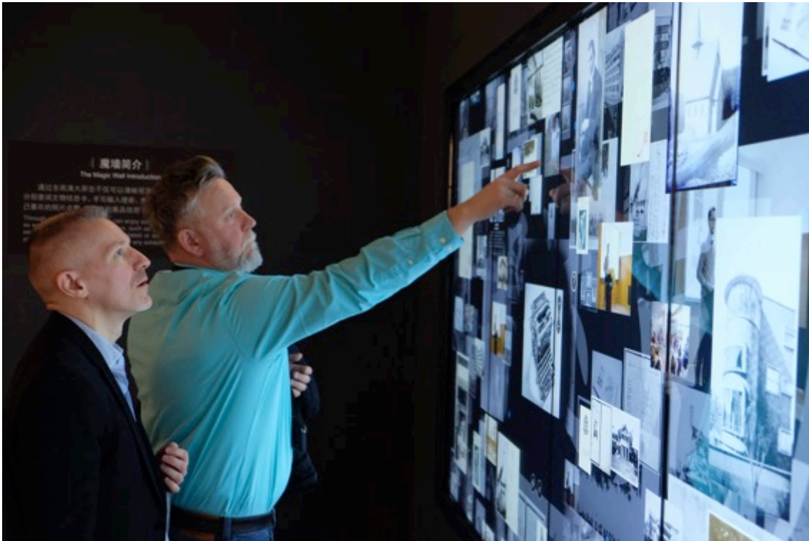
The Hudec Magic Wall