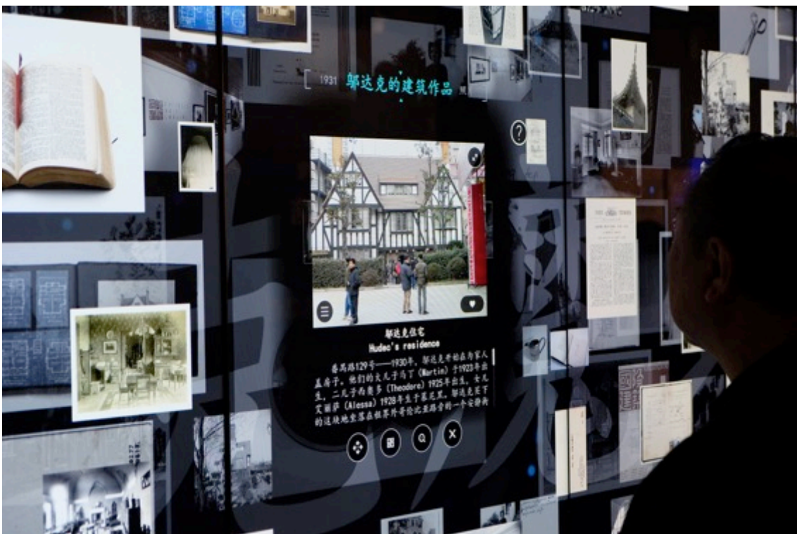
The Hudec Magic Wall

Film on VIMEO about the exhibition: https://vimeo.com/324586085