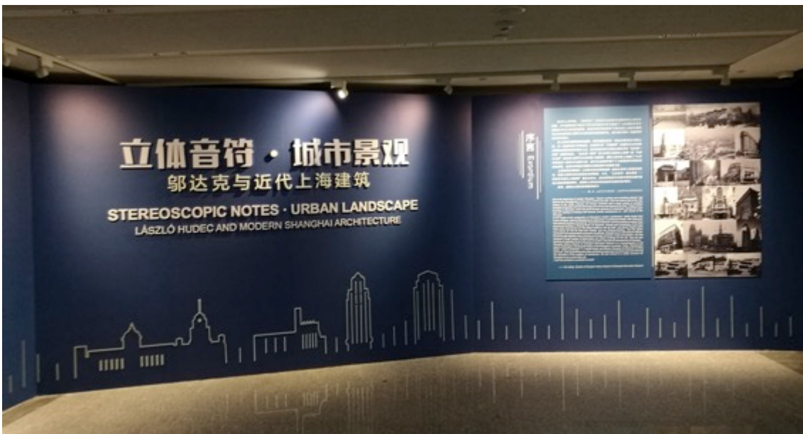
Entrance of the exhibition hall