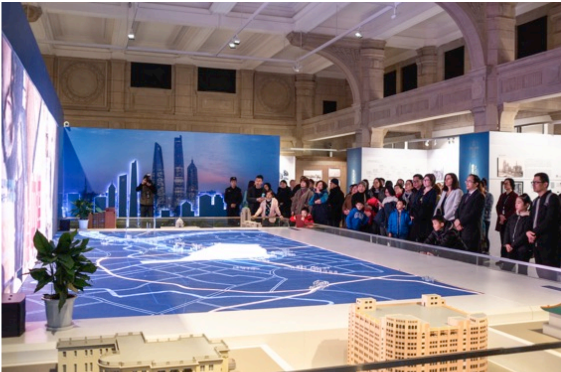
The media installation of the exhibition

The main partner and supporter of the Foundation: